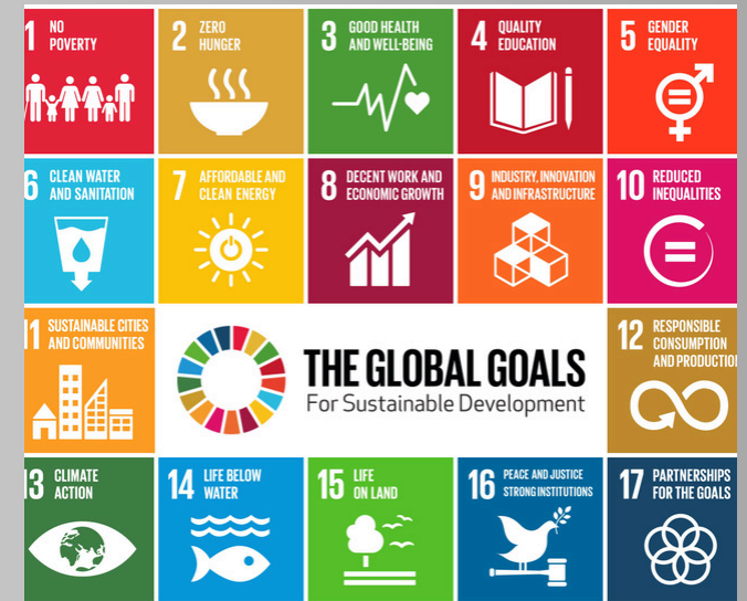
FARMERS WAY ADDRESSES 11 OF THE 17 UN SDG'S

A Peaceful, Harmonious, and Self-Sustainable Life with Nature in an Idyllic Setting away from the Pollutions of the City.