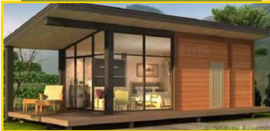
HALF KANAL - 2 BED ECO-VILLA